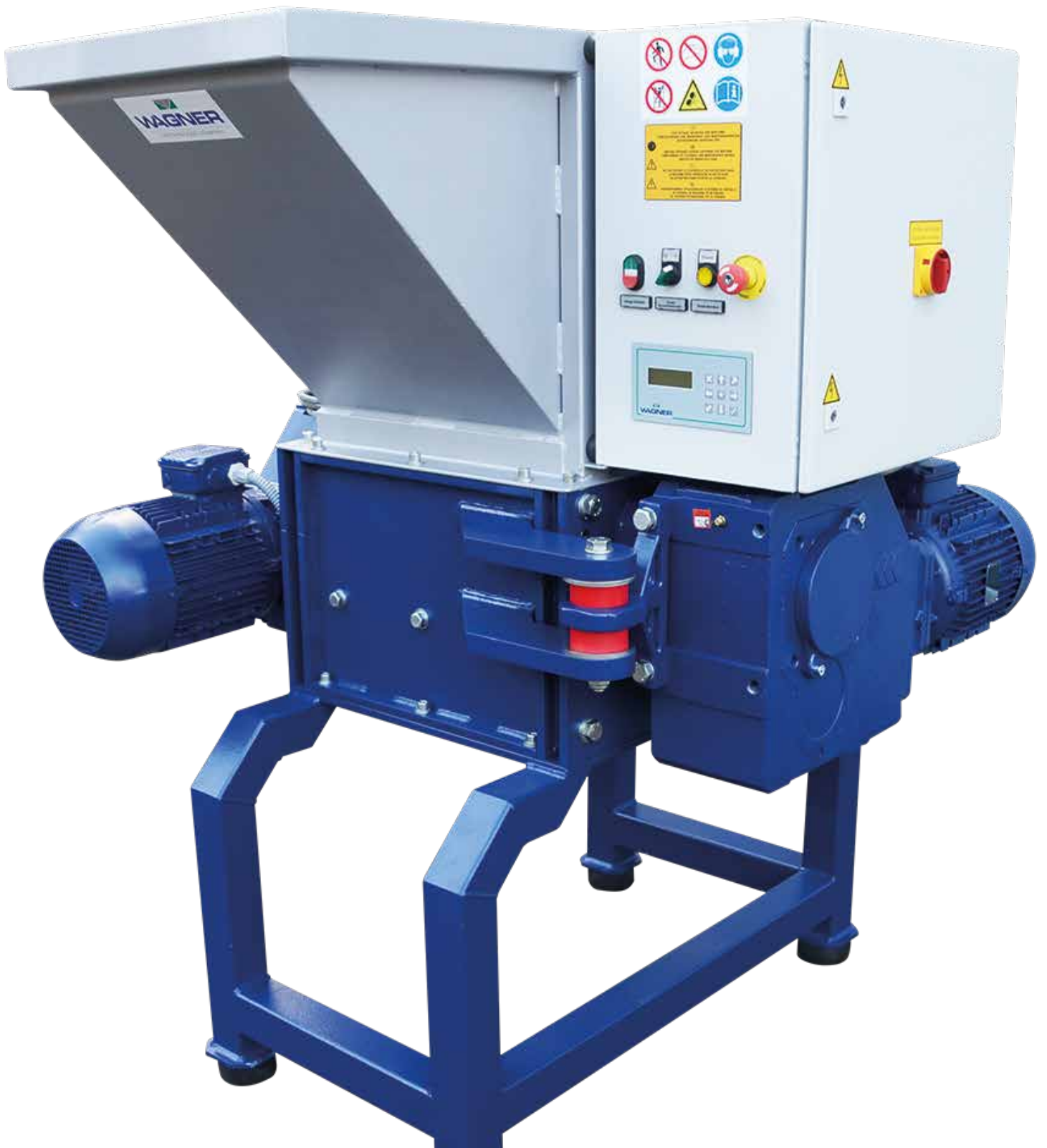
Wagner uses geared motors from Watt Drive to drive their new WTS500 twin-shaft shredder